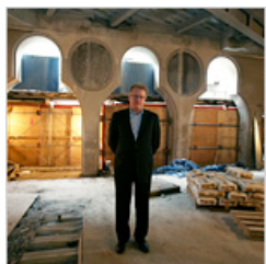
Renovating the 'Lollipop' Building