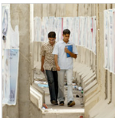
Iraqi Graduates Want to Flee