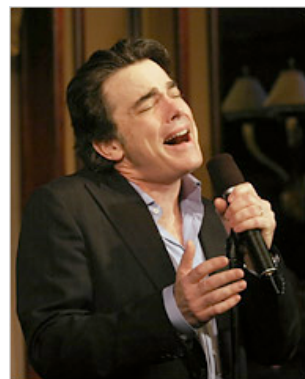
Familiar names and songs: Peter Gallagher at Feinstein's.

Peter Gallagher has the gift of gab. This New York actor, born into the Irish storytelling tradition, spins amusing yarns with an ease that turns the kind of polished after-dinner remarks usually accompanied by brandy and cigars at a black-tie function into yarns swapped by regular guys over beers in the local pub.