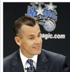
An N.B.A. Cautionary Tale